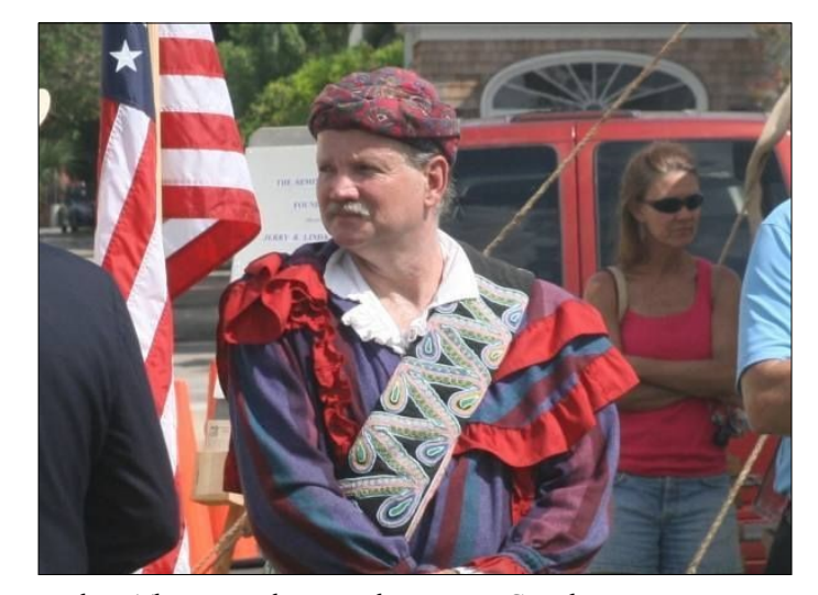
Robert Thrower

Please attend this outstanding program and bring guests who are interested in Pintlala's earliest heritage.