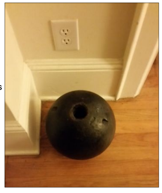
Mortar Shell